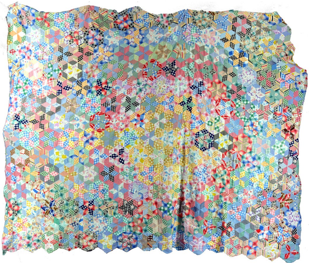
Multi-colored hexagons and stars. Hand Pieced top. Approximately 90" X 69" Irregular edges.