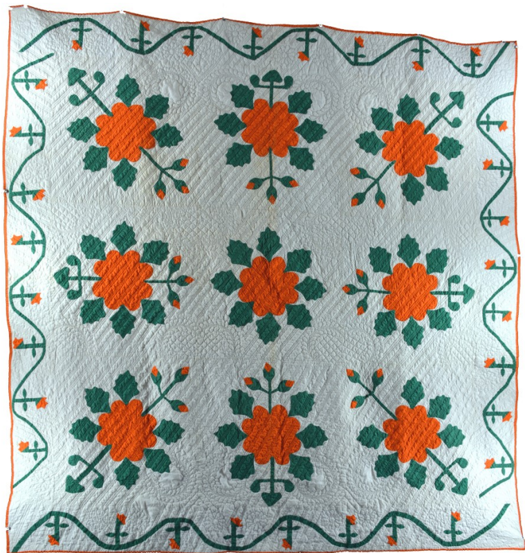
Orange Flowers with Ivy Border. Hand Quilted. Approximately 85" X 82"