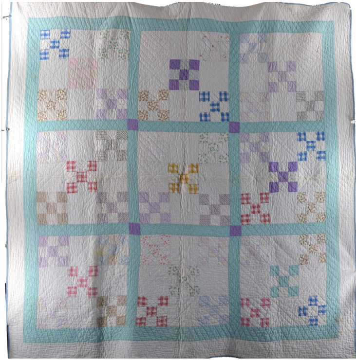
Nine Patch Quilt with Teal Sashing. Hand Quilted. Approximatel 80" X 80"