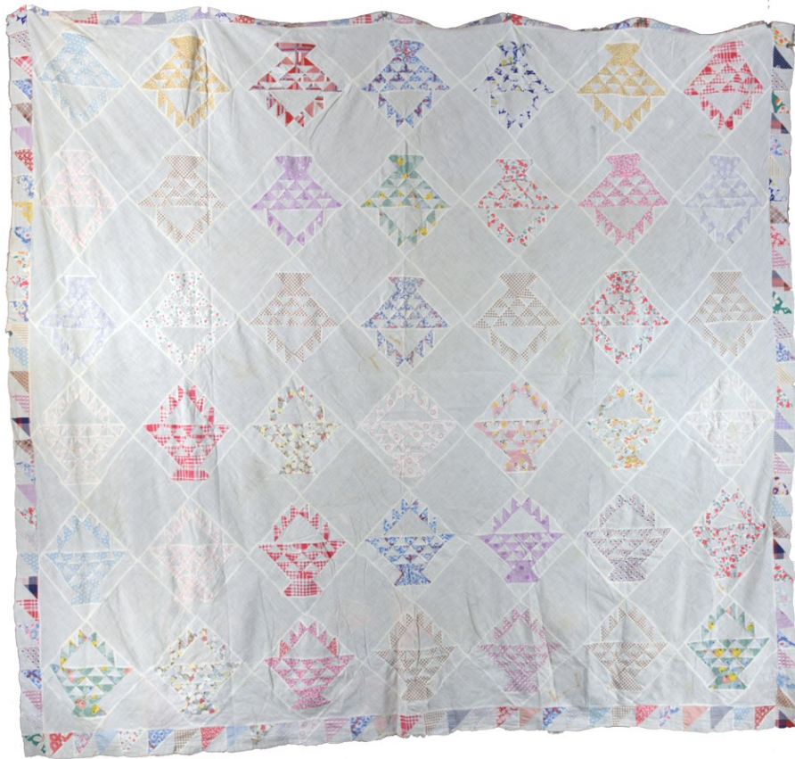
Spring Baskets on Cream. Hand pieced top. Approximately 66" X 78"