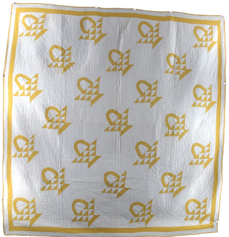
Goldenrod Baskets. Hand Quilted. Approximately 78" X 76"