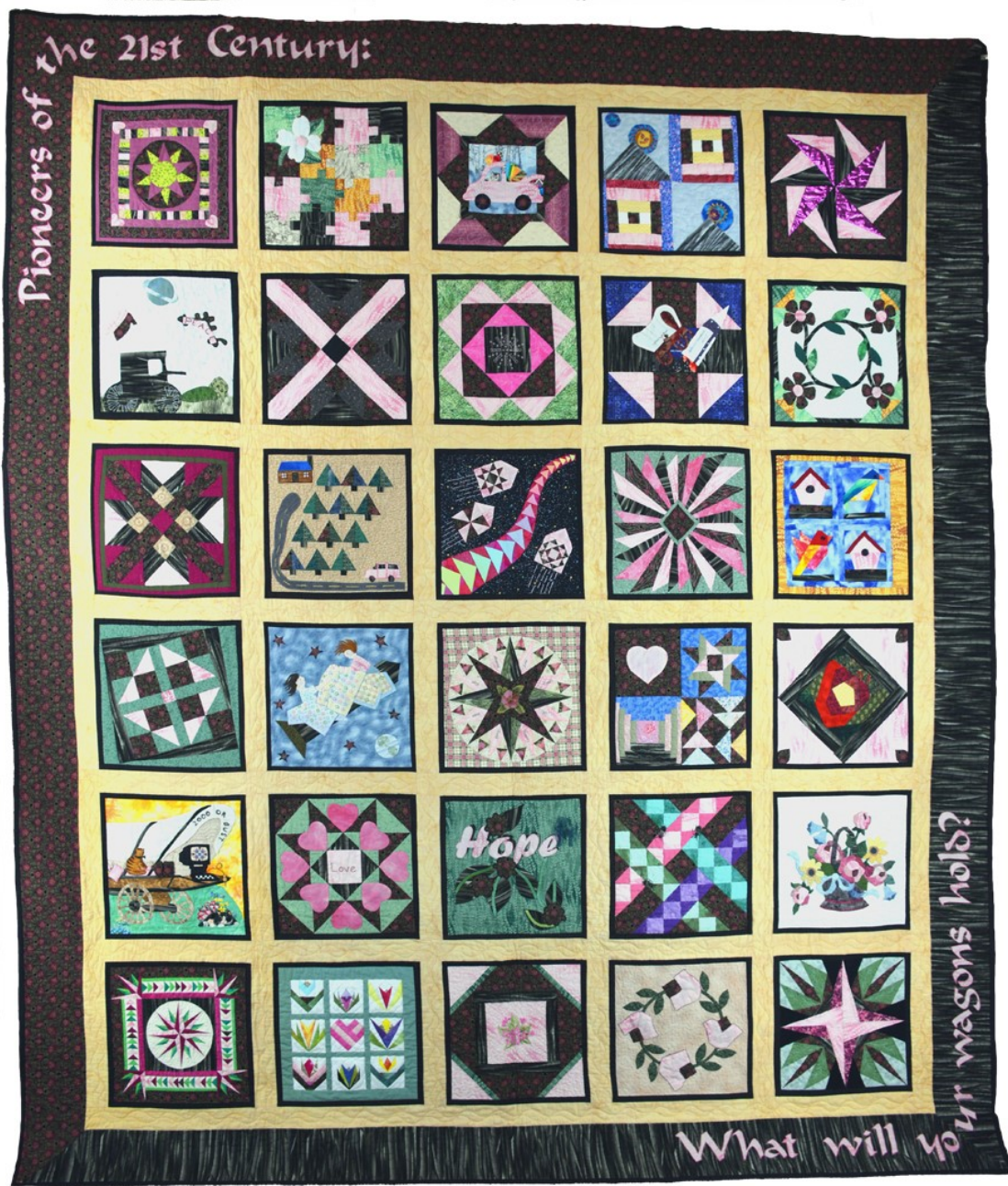
Friendship Quilters' 1999 Opportunity Quilt. Lovingly pieced by Friendship Quilt Guild. Approximately 87" X 101"