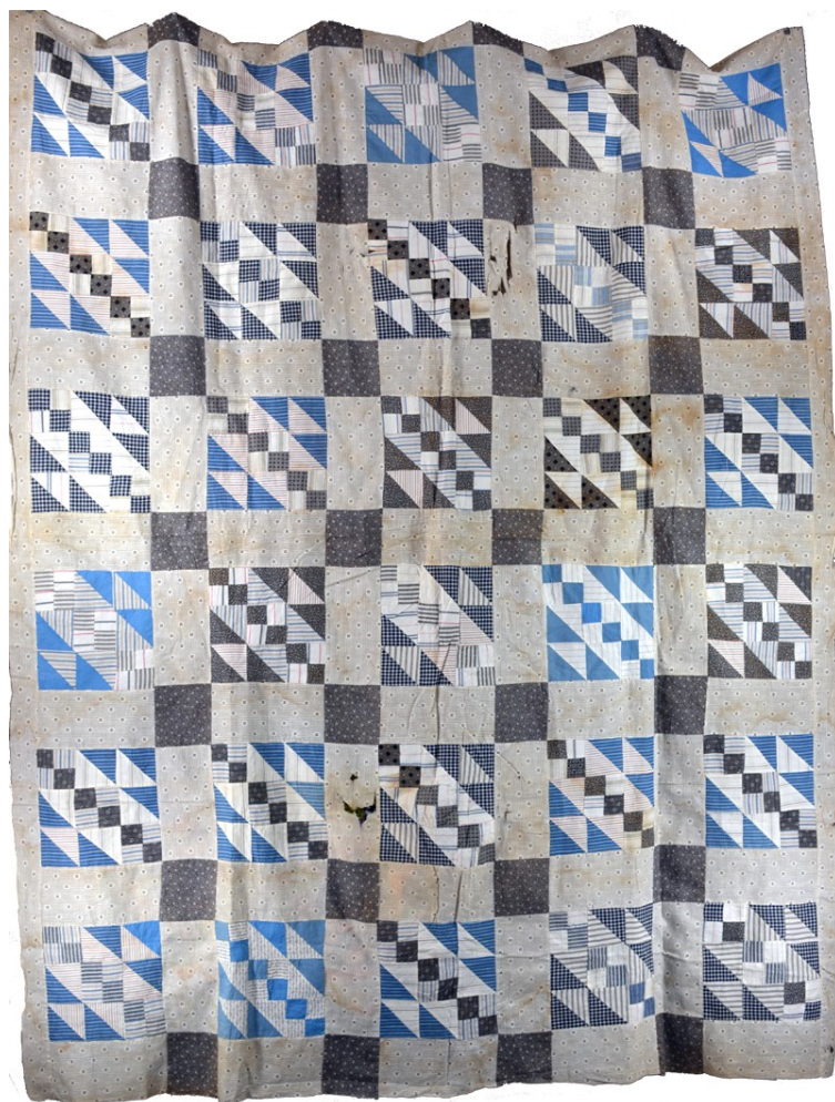
Blue vs. Gray. Hand pieced top with the exception of top and bottom borders. Approximate 69" X 89"