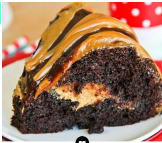
CHOCOLATE PEANUT BUTTER BUNDT LOVEFROMTHEOVEN

In a large microwave safe bowl (glass works best) combine chopped chocolate (or peanut butter chips) and heavy cream. Microwave for 30 seconds, remove from microwave and stir well. Return to microwave for another 15 seconds. Remove from microwave and whisk together until smooth (stirring will help melt chocolate). If needed, heat for an additional 15 seconds, then whisk until smooth. Spoon or pour over cake.