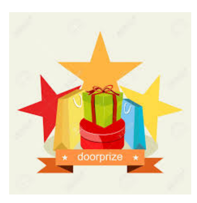
Remember to bring a wrapped gift for a door prize in your