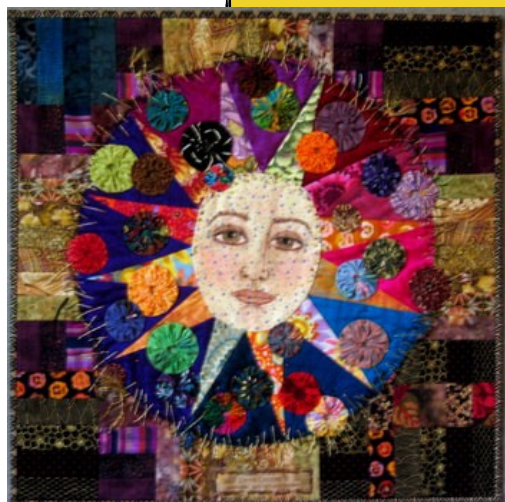
Saint So and So