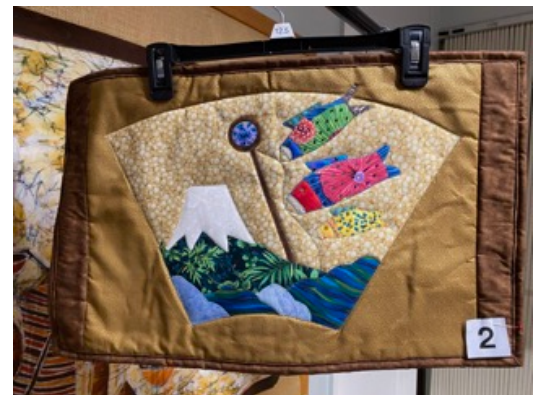
PAT HOWELL SCHMIDT