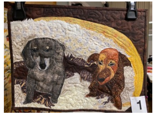
KARLA SEYB- STOCKTON